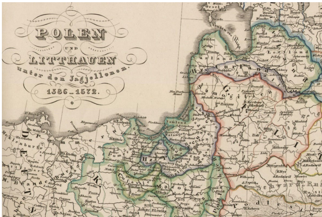
Figure 3. Cartographer, scientist, and map publisher Dr. Karl Spruner von Merz (1803–1892) and one of the most important German cartographic engravers of the 19 th century Johan Georg Perthes (1749–1816). Excerpt from the historical map of Poland and Lithuania under the Jagiellon Dynasty from 1386 to 1572. 1854 (Spruner & Perthes, 1854)

Beginning in the 3 rd century in Pomerania (German, Swedish: Pommern , Polish: Pomorze , Latin: Pomerania , Pomorania ) (Fig. 3), many settlements were abandoned, marking the beginning of the Migration Period taken to have begun in 375 (possibly as early as 300) and ended in 568. It is assumed that Burgundians, Goths, and Gepids with parts of the Rugians left Pomerania, while some Veneti, Vidivarii, and other Germanic groups remained and formed the Gustow, Debczyn, and late Willenberg cultures that existed in Pomerania until the 6 th century. The southward movement of Germanic tribes and Veneti had left Pomerania largely depopulated by the 7 th century. Between 650 and 850, West Slavic tribes settled in Pomerania. These tribes who were collectively known as ‘Pomeranians’ settled between the Oder and Vistula Rivers. Veleti (later Liuticians) arrived west of the Oder. The distinct tribe Rani was based on the island of Rügen (Fig. 3) and the adjacent mainland. In the 8 th and 9 th centuries, Slavic-Scandinavian emporia were set up along the coastline as powerful centers of craft and trade.