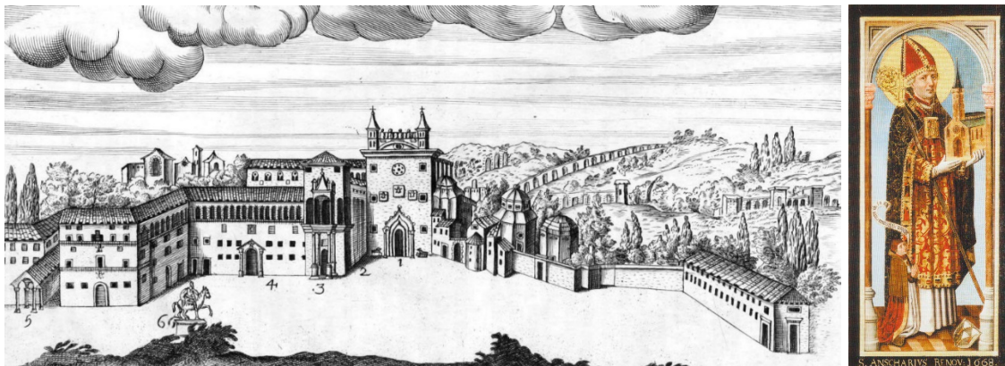
Figure 4. An ecclesiastical archaeologist Giovanni Giustino Ciampini (1633–1698). Drawing of a fortified L-shape structural complex including: 1 – Lateran Basilica, 2 – Council Hall, 3 – Balcony of Boniface VIII, 4 – Lateran Palace, 5 – Holy Stairs, 6 – Statue of Marcus Aurelius. 1693 (Online 13.01.2018, source:

https://upload.wikimedia.org/wikipedia/commons/0/00/De_sacris_aedificiis_a_Costantino_Magno_constructis_synopsis_historica_pag_17_Tab_V.jpg