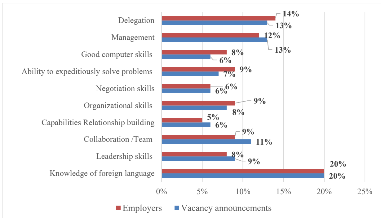
Figure 2 Social Competences (prepared by the authors)

The analysis of social competence list (Figure 2) produced a rather similar set of results.