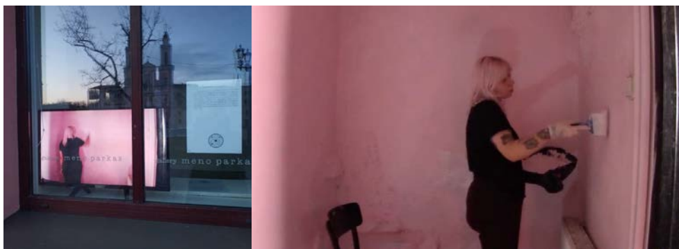
Figure 1 and 2 Ieva Bartuškaitė's "ART IS A DIRTY JOB...". Photo 1. Photo by Vaida Tamoševičiūtė; Photo 2. Still image from the video by Ieva Bartuškaitė

These two performances exemplify the connectedness of the students to the thematic frame of colours as signifiers of the statements expressed by their artwork. The tools and materials that they used were available at their homes. These two examples were chosen due to the reason that Tamoševičiūtė emphasised them as examples in the interview. This gave an opportunity for a brief discussion about these two artworks. Further, the author contacted Bartuškaitė and Gotautaitė with follow-up questions about their performances and a request for permission to use their images in the article.