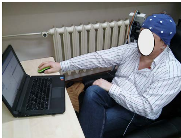
Figure 2 QEEG Testing while Working with the Simulation Program [own study]

QEEG research was conducted on a randomly selected group of students in the 2019/20 academic year. Students were asked to perform an engineering project in the simulation software of their choice. The QEEG test consists in active registration and observation of the brain during work, therefore, due to the quantitative limitations of this method, the research was conducted only on a group of 50 people. An example of such a test while working with simulation software is shown in Figure 2.