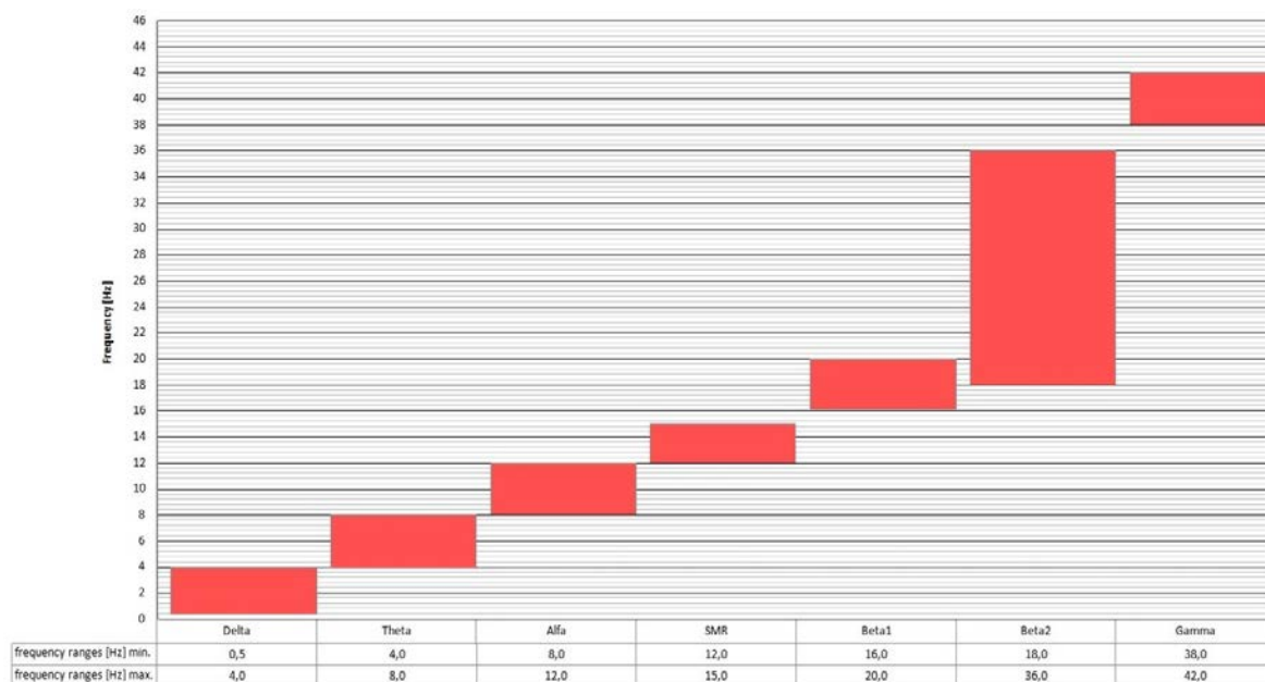
Figure 1 A Simplified Diagram of the Waves Occurring during the Research

cognitive activity can be registered in different parts of the brain (Sadowski, Chmurzyński, 1989). Therefore, the indicator of the occurrence of a given variable will be not so much the topology of a given wave (related to elementary activities), but its occurrence, course and time of formation (Fig. 1).