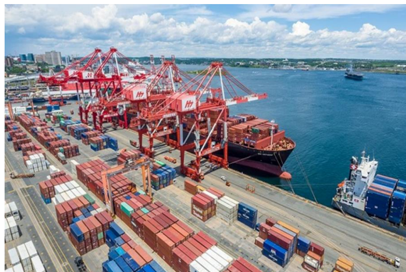
Figure 1. Ship-to-shore crane (Pakpedia, 2017)

A ship-to-shore (STS) crane is a large piece of equipment, most commonly used in port operations to load and unload cargo containers from ships (see Figure 1).