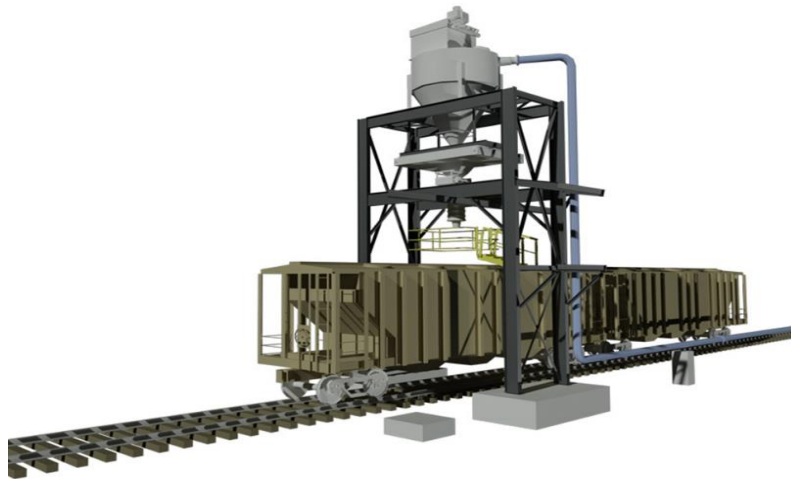
Figure 3. Pneumatic Railcar Loader ( LB Industrial System, n.d. )

Loading equipment for Bulky products, e.g. rail cars (the LB Industrial system version) consists of a storage silo built on grade or on a support structure that receives bulk material pneumatically conveyed from the plant (see Figure 3).