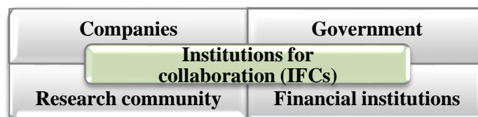
Figure 2. Cluster structure (Solvell, Lindqvist, Ketels, 2003, p. 18)

Clusters consist of co-located and linked industries, government, academia, finance and institutions for collaboration (Figure 2).