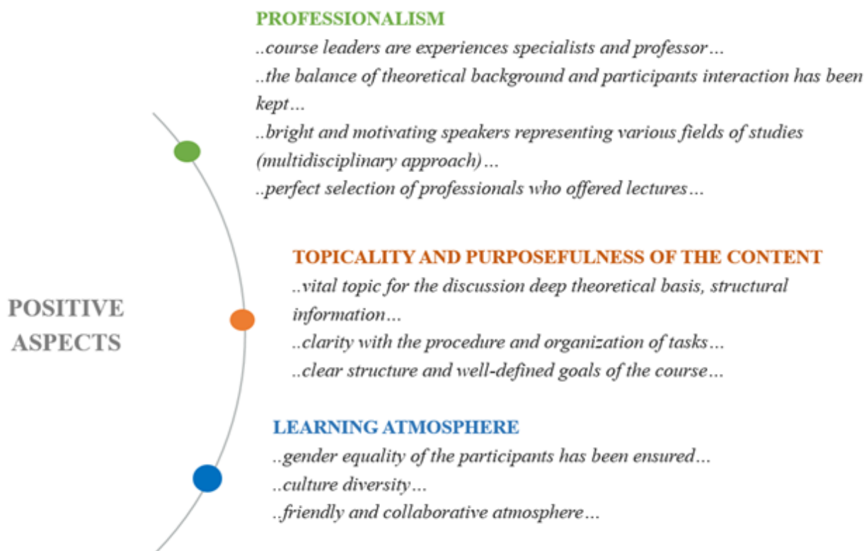
Figure 3. Positive aspects of the program, according to the participants' feedback

Summing up, the participants of online program emphasized the high level of organization and successful cross cultural, cross border collaboration in online environment. The analysis of the project participants' feedback highlighted several positive aspects of the program (Fig.3).