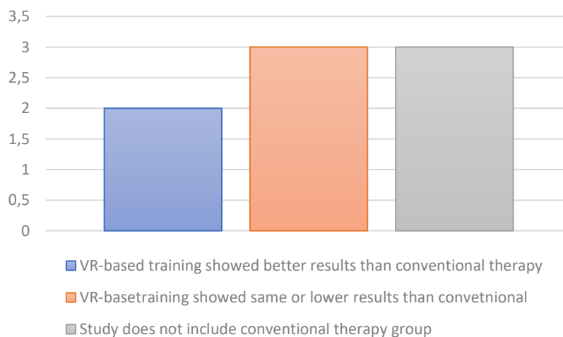
Figure 2 Result comparison between VR-based training and conventional training (n=number of studies)